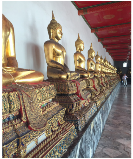
Row of Earth Touching Buddhas at Wat Pho Bangkok, Thailand