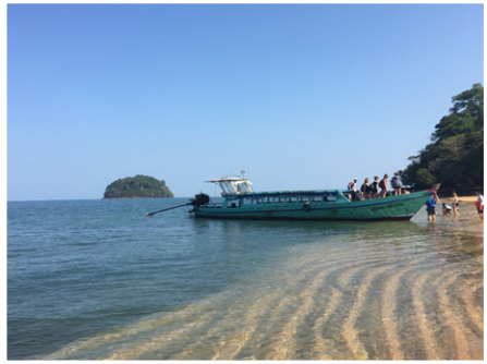
Ko Chang, Ranong, Thailand

! The application deadline for 2017 Summer & Fall programs is February 15th.