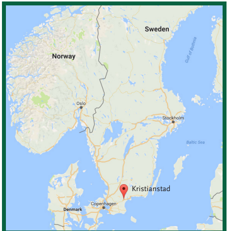
Kristianstad, Sweden, is located in Skåne County in southern Sweden.

For more information on MSU's life-changing study abroad programs visit www.MinotStateU.edu/International and visit the Office of International Programs.