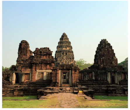
Khmer ruins in Phimai, Thailand

Studying abroad in Thailand completely changed my life and I couldn't be happier. I grew as an individual, both spiritually and emotionally, and experienced things I can't even put into words. I think this experience had positively affected my future and most importantly shown me a path which to continue my education and focus my studies. Every experience, whether negative or positive, I encountered over the course of my three months abroad shaped me to be who I am now and I cannot wait to see what my future has in store for me.